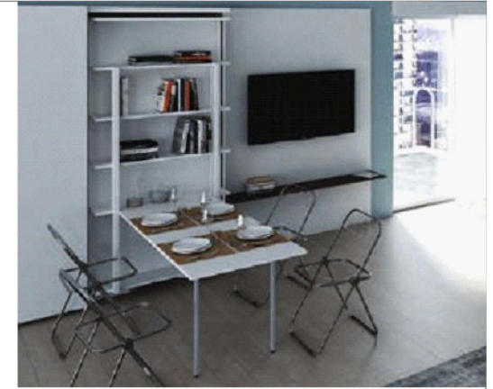
LETTO LSG TABLE